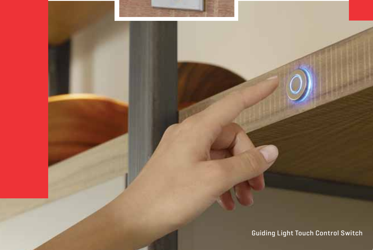
Guiding Light Touch Control Switch