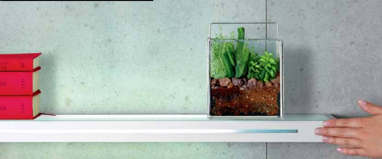
Touch Control Illuminated Shelf