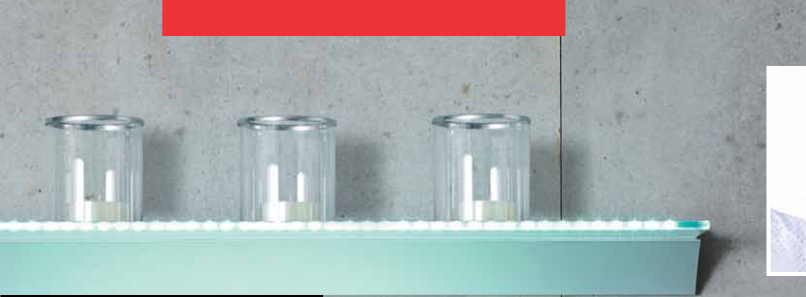
Touch Control Glass Shelf