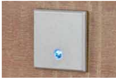
Touch Control Switch

All spot models of SAMET Lighting Systems offer their users the freedom to control furniture lighting as they wish. Due to options, such as Touch Control with Leading Light, Wooden Surface Mounted Switch and Motion Sensor, turning furnished areas into elegant spaces.